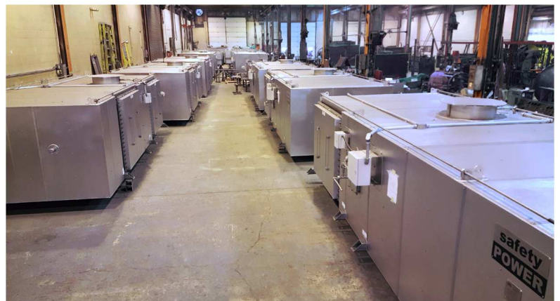
A multi-engine SCR project in the final stages of production.

Safety Power's full family of FOx®, ecoCUBE® and ecoTUBE™ provide emission control solutions for engines of all size, 100kW-20MW.